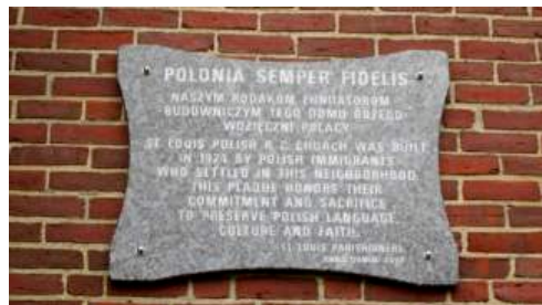
Image of Our Lady of Czestochowa, St Louis Church, Portland, Maine, and a plaque that hangs on the outside of the church building (built in 1924) both photographed there in 2013.